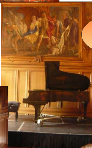
The audience is gathering in the Music Room.