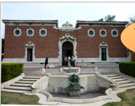
The William Andrews Clark Memorial Library