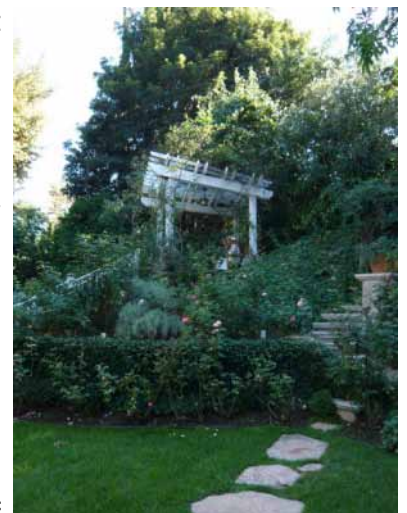
COPW members and guests spilled out into the lovely patio awaiting the program.

received a standing ovation from the audience. Several guests remarked that it was the most beautiful solo violin performance that they had ever heard.