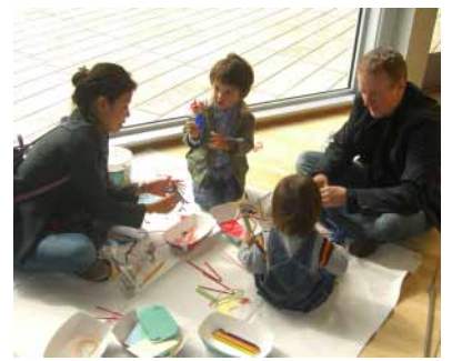
Families enjoy the pre-concert crafts and musical activities together.