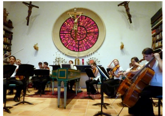
Festival Orchestra at Chapel Concert