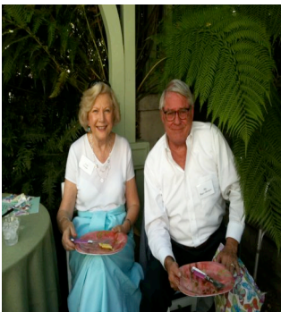
Enjoying the shade