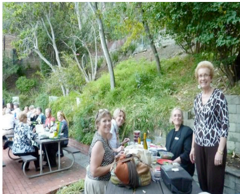
Picnicing and enjoying good friends