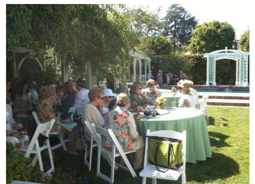
COPW enjoying the flower & music