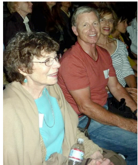
Loving the music