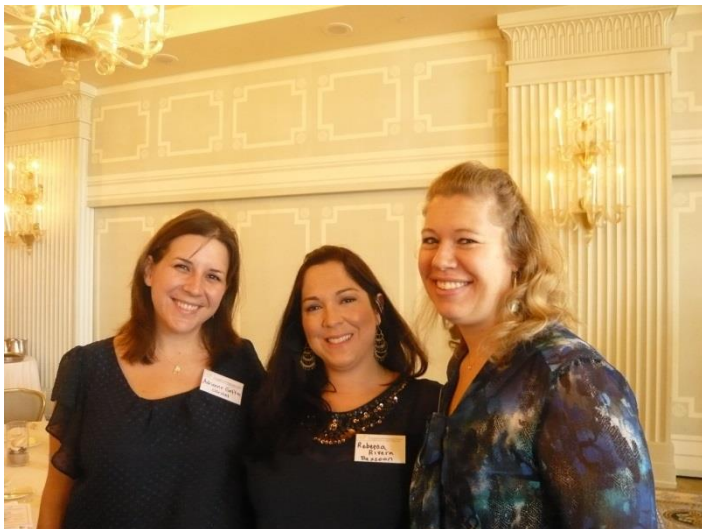
A talented woodwind trio of performers, "Third Wheel"