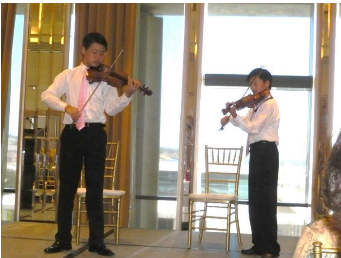
Two young performers play the "J.S. Bach Double" for the Affiliates Spring Celebration.