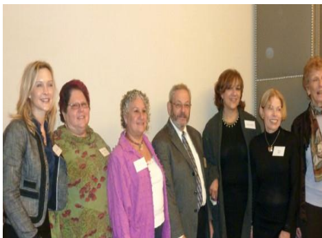
New COPW members and mentors at the Luxe Hotel.